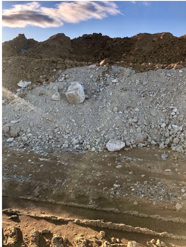
Above -Same viewpoint from one neighbor's home in April 2021 in January 2023.